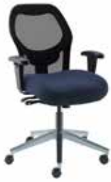
Zephyr Mesh Back Series