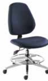
MVMT Tech Series with Classic Base