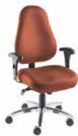
Intensive Plus Series