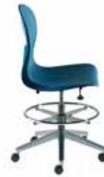
Skoop Polypropylene Molded Series