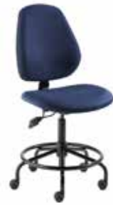
MVMT Tech Series with Heavy Duty Base